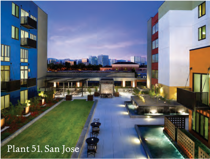
Plant 51, San Jose